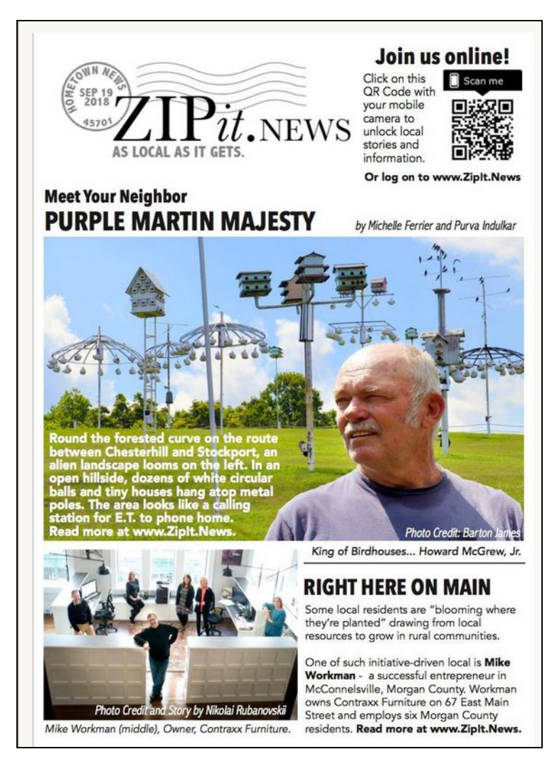
Figure 2: Example of Postcard